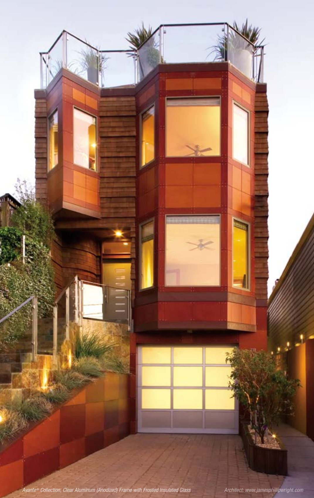
Avante® Collection, Clear Aluminum (Anodized) Frame with Frosted Insulated Glass