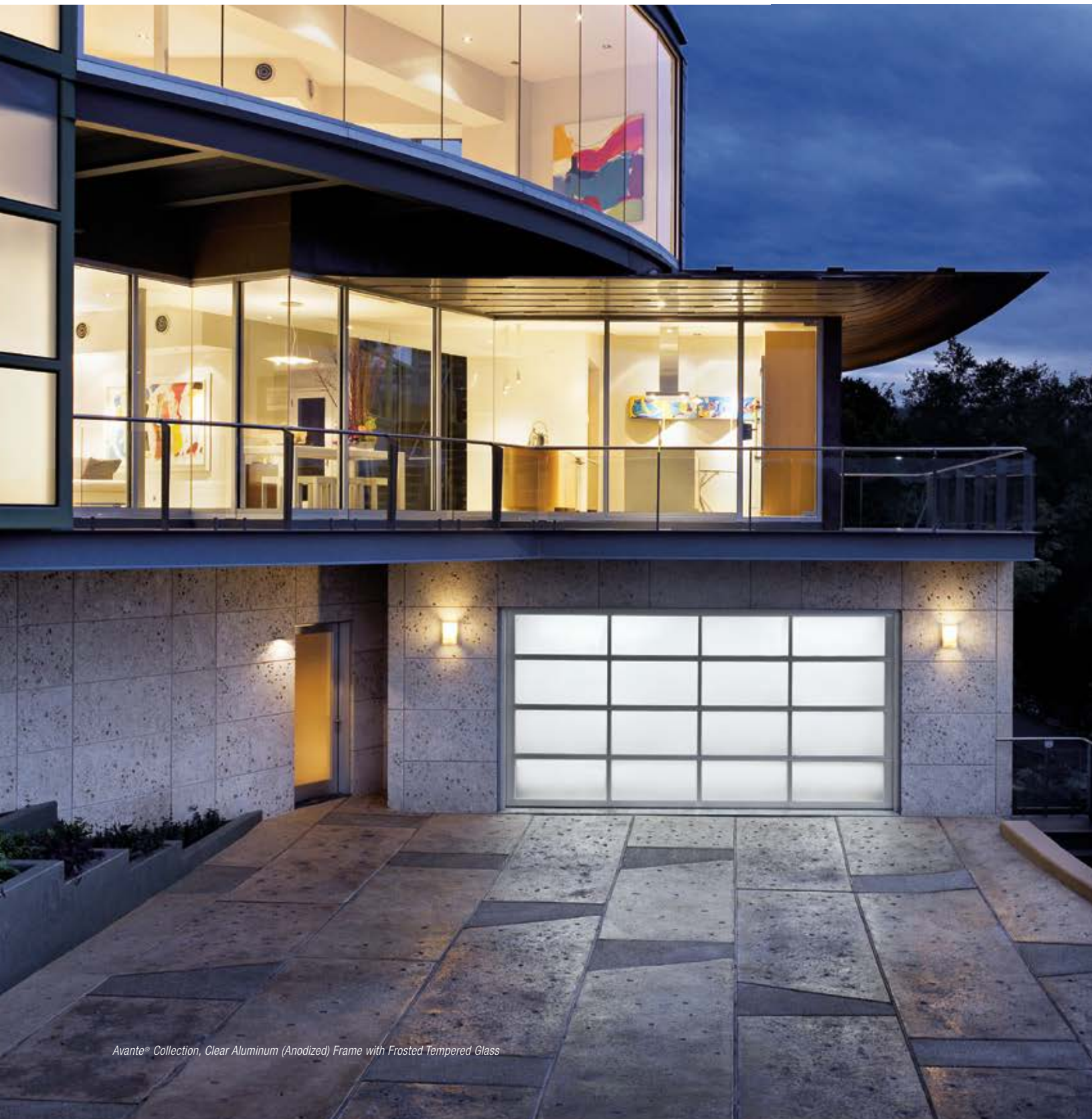
Avante® Collection, Clear Aluminum (Anodized) Frame with Frosted Tempered Glass