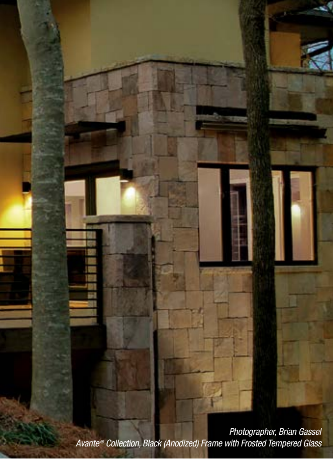
Avante® Collection, Black (Anodized) Frame with Frosted Tempered Glass