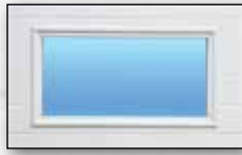
24" x 12"