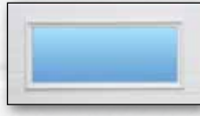
30" x 12"

Windows shown with white frames. All three models available in 1/2" Insulated Glass or 1/8" DSB.